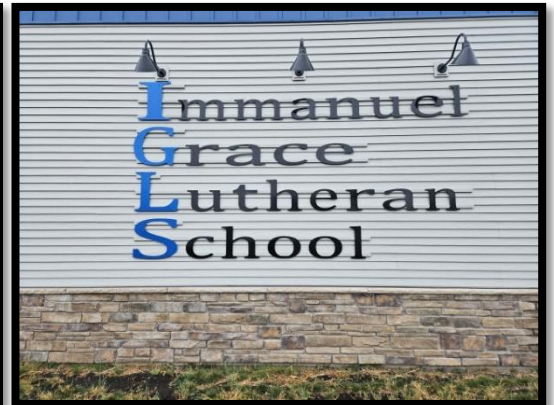
The new signage

3M Current Employees and Retirees: Each year, if you volunteer at least 25 hours in the current year at the school and/or for school functions, you can submit your hours to 3M Gives and 3M will gift the school $500 once approved.